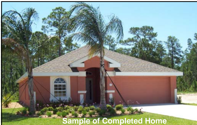
Sample of Completed Home