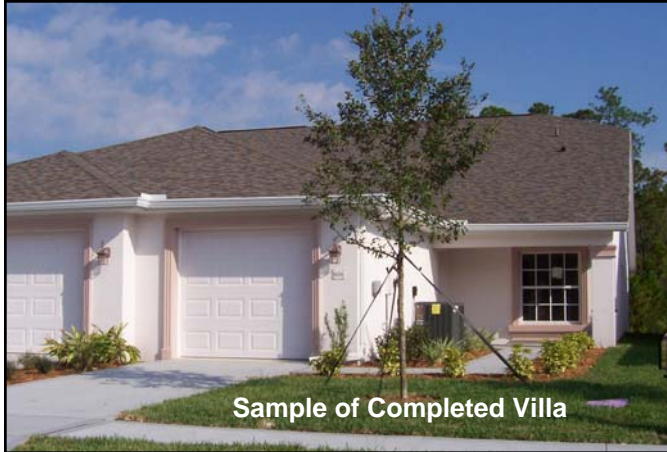
Sample of Completed Villa